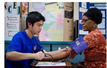
Above: Health Occupations Program demo at Tech Show 2015.

The Benson Tech Health Occupations Program has provided valuable introductory preparation for hundreds of Benson Tech students interested in a career in the many facets of health and medical care. Many of those graduating from the program have gone on to careers as doctors, dentists, medical technicians, nurses, and hospital and clinic workers. While we don’t know who all of you are by name, we especially appreciate your efforts during this COVID-19 pandemic.