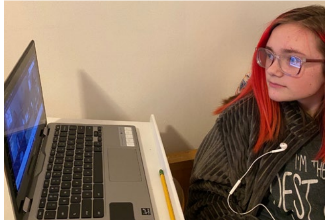
Above: Benson Tech students learning in the virtual classroom for fall term 2020.

overlap, many athletes may have to decide in which sports they will participate this year. As more details are known, the BPHSAA will post information on its webpage .