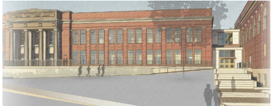
Above: Design visualization of updated Benson Tech entrance

For more information about Benson Tech's modernization, visit the school's page in the School Building Improvement Bond section of the PPS website. The animated flythrough of the design for Benson Tech's campus linked there is especially interesting.