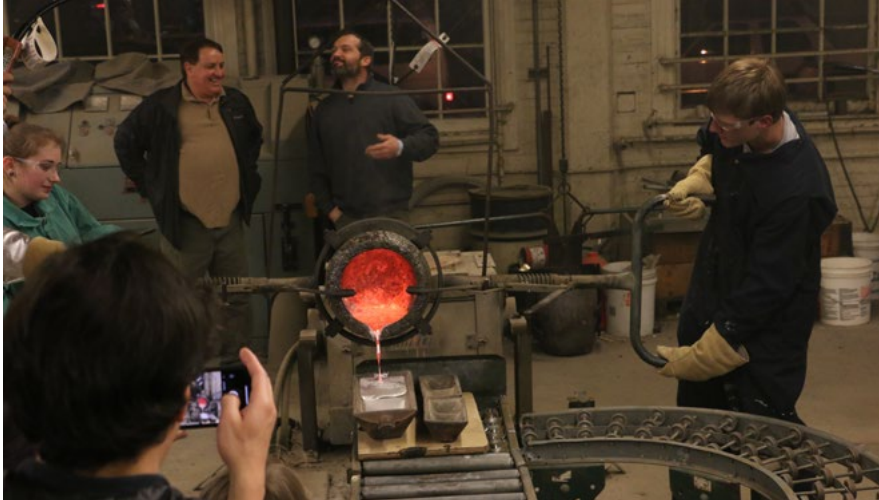
Above: Shop demonstration from past Benson Tech Show.