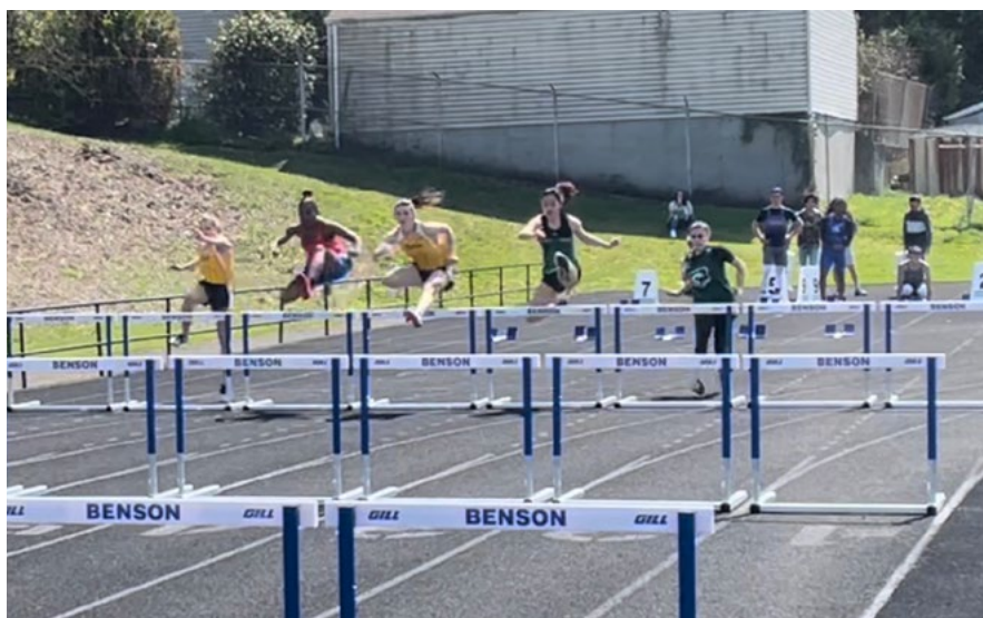
Above: Hurdle event held during the Benson Tech Invitational Meet held at the former Marshall High School Campus on April 23, 2022. Nine high school teams competed at the meet.