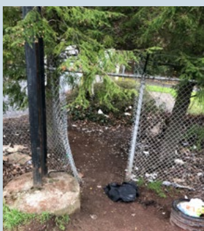
Above: Litter on the Marshall Campus prior to efforts by Benson Tech coaches and volunteers (including BPHSAA Board of Director members) to clear up and haul it away in time for the school's inaugural track and field invitational meet.