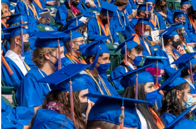
Above: Members of the graduating Benson Tech Class of 2021.

The Benson Tech Class of 2021's graduation rate was 93% according to the Oregon Department of Education's "Graduation Report Card" (the latest numbers available). This puts Benson Tech again among the top schools in Oregon, where the average rate was 80.6%. Only Grant High School (95%) and Lincoln High School (95%) had slightly higher numbers than Benson Tech's among Portland's public schools where the average was 84% in 2021. Of the Benson Tech students graduating, 71% have begun either a two- or four-year college. (It should be noted the Class of 2021 completed the last of its high school graduation requirements while coping with virtual classes for over a year and separation from their classmates due to the COVID-19 pandemic restrictions.)