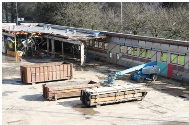
Above: Bound trailer loads of timber salvaged from demolition for Benson Tech modernization. They will be recycled for other uses.